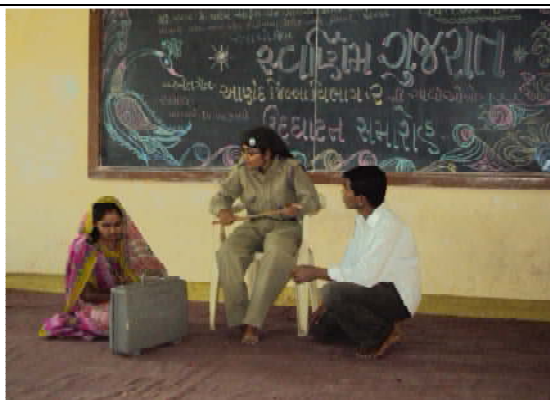
P-3 Swarnim Gujarat drama competition by college students