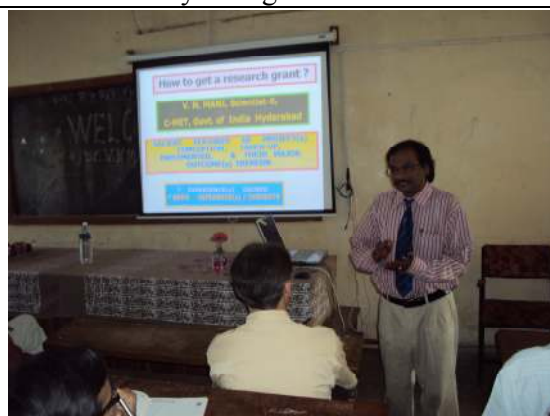
P-5 A Seminar on "Expanding Horizons of Science" on the Celebration occasion of National Science Day