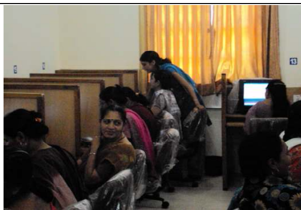
P-6 A unique programme of Computer Training for the senior citizens