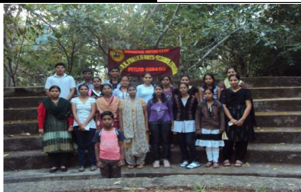
P-2 Botanical Tour visit to 'Bakor Abhayaranya' on 15-16-December 2009